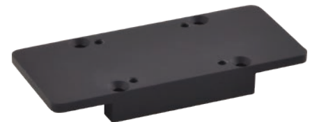
AP-CC-01 Conduction-Cool Kit

APSW-API-LNX Linux® support (website download only).